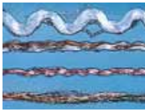
Fancy filament yarns