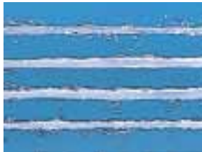
False twist texturised filament yarns