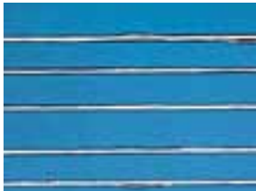
Flat filament yarns

Trevira CS textiles are noteworthy for high colour brilliance and fastness to light. They are extraordinarily hardwearing and retain their attractive qualities for a long time, even with intensive use. Upholstery fabrics withstand high levels of abrasion and do not stain other textiles. Trevira CS materials are easy to clean and are quick drying. They are low-crease and retain their shape after washing. Marks can easily be removed with traditional cleaning agents and methods. They are, incidentally, quite economical to maintain. Unlike what happens with other fabrics, washing them takes substantially less water, less detergent and – thanks to short drying times – less energy to dry them.