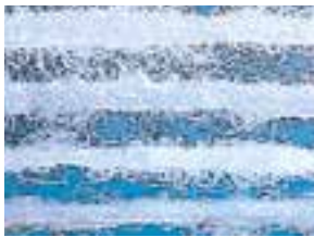
Jet-Text or Jet-Tweed yarns